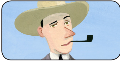
Wild Life* Amanda Forbis 14 min / 2011 / Canada