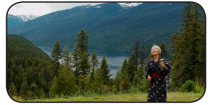
Telling the Stories of the Nikkei Behind the Scenes Mo Simpson, Catrina Longmuir 13 min / 2011 / Canada