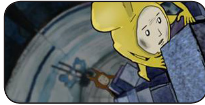
The Perfect Detonator Jay White 10 min / 2011 / Canada